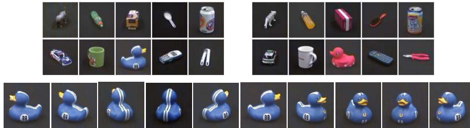
Fig. 2. Examples of training (left) and test objects (right) used for our categorization task, where 15 different categories are trained. As color categories red, green, blue, yellow and white are trained. The shape categories are animal, bottle, box, brush, can, car, cup, duck, phone, tool. Each object was presented in front of a black background while rotating around the vertical axis (bottom), resulting in 300 images per object.

are multi-colored (e.g. the cans) where not only the base color should be detected, but also all other prominent colors. This multi detection constraint complicates the categorization task compared to the case where only the best matching category or the best matching category of a specified group of visual attributes (e.g. one for color and one for shape) must be detected.