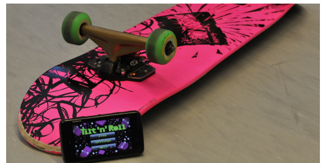
Figure 1: Our platform, consisting of a skateboard with a sensor module and custom riser pad (only one mounted for comparison) and a smartphone.

We present an approach that sets itself apart from current movement-based game concepts in that we use an ordinary piece of sports equipment as input device for an outdoor game. Our prototypical skateboarding game Tilt'n'Roll is played by riding a real skateboard and performing tricks to control the game. To this end, we have equipped a regular skateboard with sensors that allow monitoring its motion and detecting performed skateboarding tricks. The game engine runs on a mobile phone, so the game can be played wherever there is a suitable skateboarding spot.