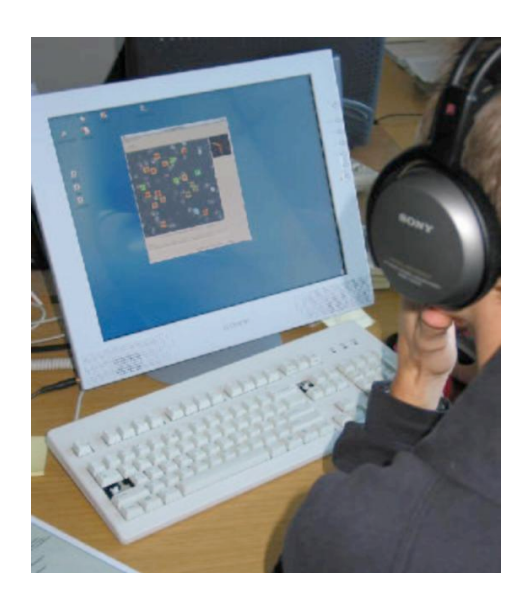
Fig. 4. Experimental set-up of visualization/sonification-based exploration