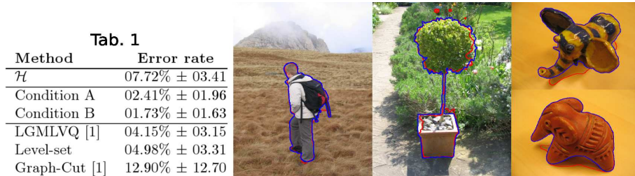
Figure 2: Left: Comparison of the segmentation to the ground truth (mean and std. dev. of pixel-wise error rates for 50 images), showing the similarity of \mathcal{H} as well as the similarity of the foreground segmentation and comparable results from other state-of-the-art methods. Right: Four examples (blue outline for ground truth, red outline for the boundary of foreground segmentation). Some problems are visible due to a wrong curvature weight \nu as well as systematic errors because of shadows occurring near the object boundary.

the estimation of the parameters on the data, incremental methods to estimate the model complexity (number of prototypes), an integration of user-constraints or a direct extension towards a three dimensional segmentation of video data.